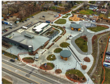
INNISFIL TOWN SQUARE DEVELOPMENT Rutherford Contracting, ON