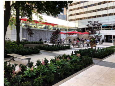
100 KING STREET WEST Urban Garden, ON