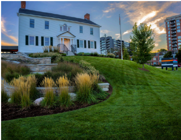
JOSEPH BRANT MUSEUM Andy's Lawn & Landscape, ON