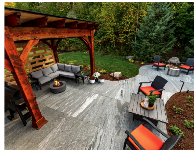
AGORA Rugged Earth Landscaping, ON