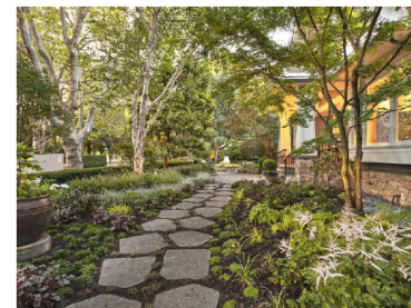
SHAUGHNESSY SHADE GARDEN Swick's Landscaping, BC