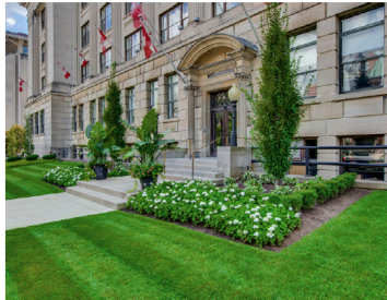
CANADA LIFE Clintar, ON