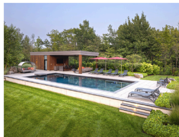
ALPINE REFLECTIONS The Landmark Group, ON