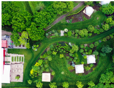
THE RETREAT GARDENS PHASE 1 Lavish Gardens, ON