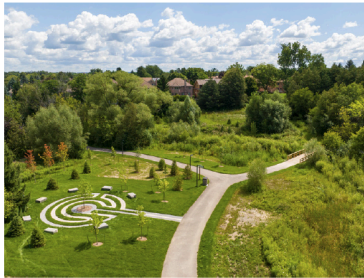
HIGHLAND GATE Griffith Property Services, ON