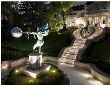
STAIRWAY TO HEAVEN Pro-Land Landscape Construction, ON