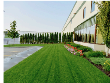
ULINE EDMONTON Land Tec Landscape Contractors, AB

Congratulations to the 2025 Circle of Excellence! Representatives from these projects will be invited to the gala on August 12, when their projects will be highlighted throughout the evening and the top-scoring projects in each category will be revealed live .