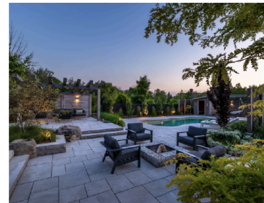
BEACHIN' Hutten & Co., ON