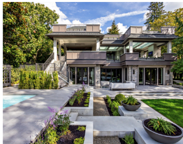
CONNAUGHT MANOR - SHAUGHNESSY ESTATE Swick's Landscaping, BC